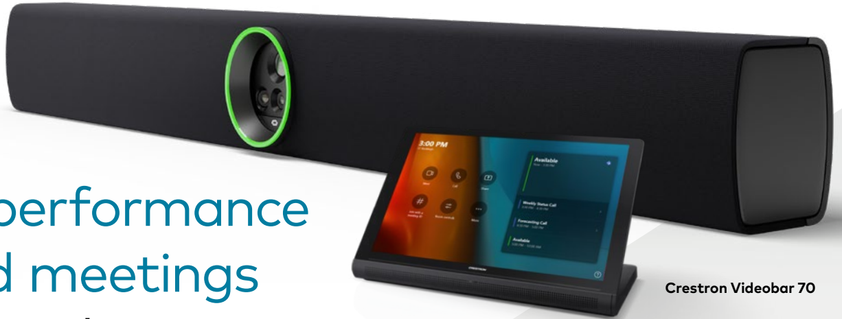
Crestron Videobar 70

Packed with everything needed to create hybrid meeting equity in medium and large spaces, the Crestron Videobar 70 all-in-one collaboration bar delivers both room-filling audio and intelligent video technology in a single device — with Android™ OS for easy deployment.